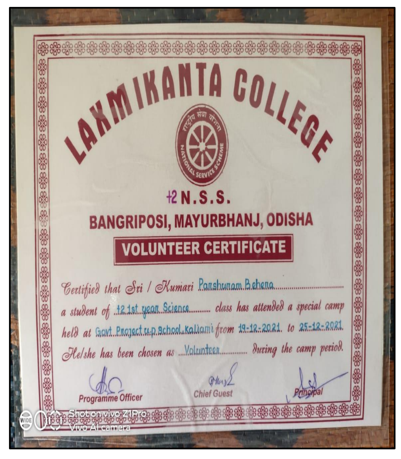
Fig No. 7.2:- NSS Certificate