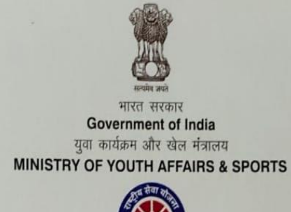
Fig No. 7:- NSS Certificate