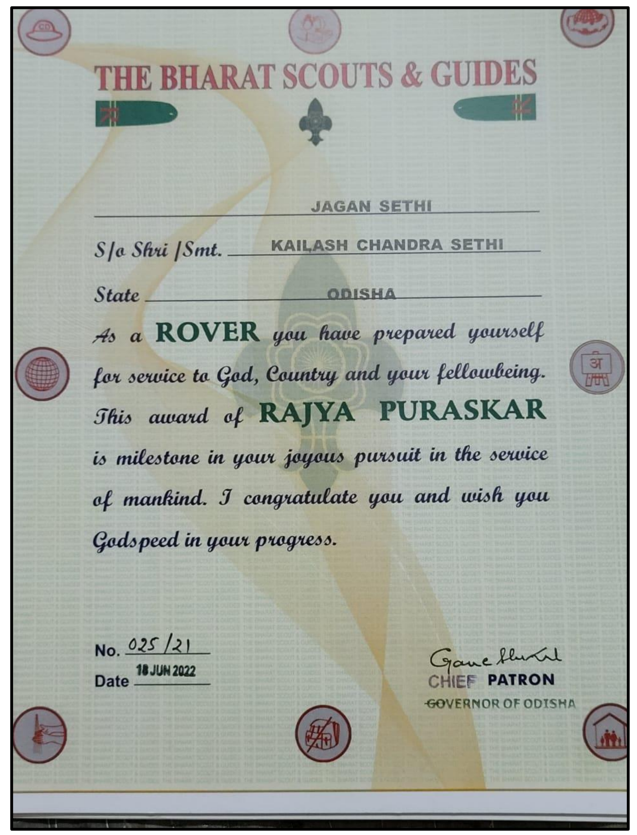
Fig No. 8:- Rover & Ranger Certificate